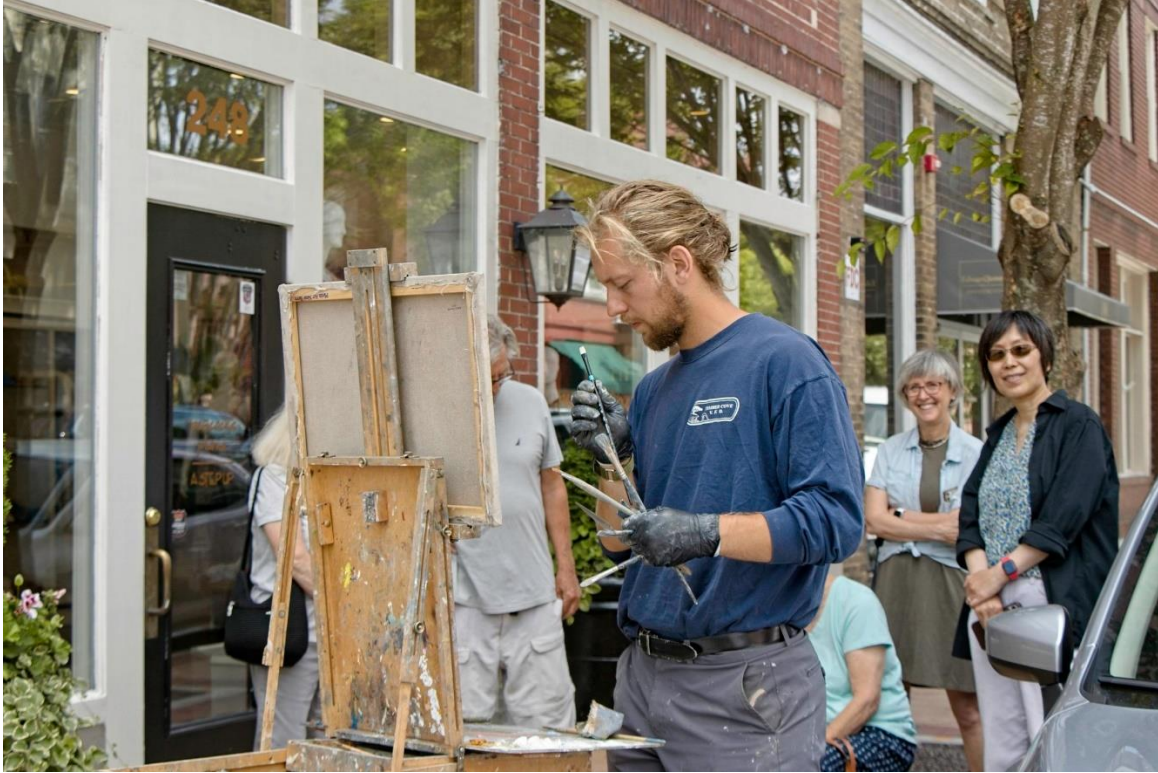
Daily scheduled demonstration to interact with artists. – NC Plein Air Art Festival in New Bern