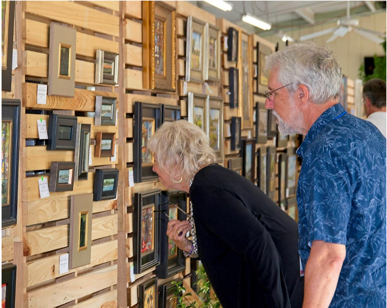
Exhibition and Sales for wet canvases – NC Plein Air Art Festival in New Bern

Festival headquarters, including demonstrations, workshops, art displays, and sales, will be based in historic New Bern's Farmers Market, less than two blocks from Tryon Palace. In addition, pop-up exhibits and art sales will happen in Beaufort and Oriental, with location details, dates, and times on the NC Plein Air website. All activities are free except the workshops, Saturday's awards celebration, and a modest fee for artists to enter the Quick Paint competition (no charge for spectators).