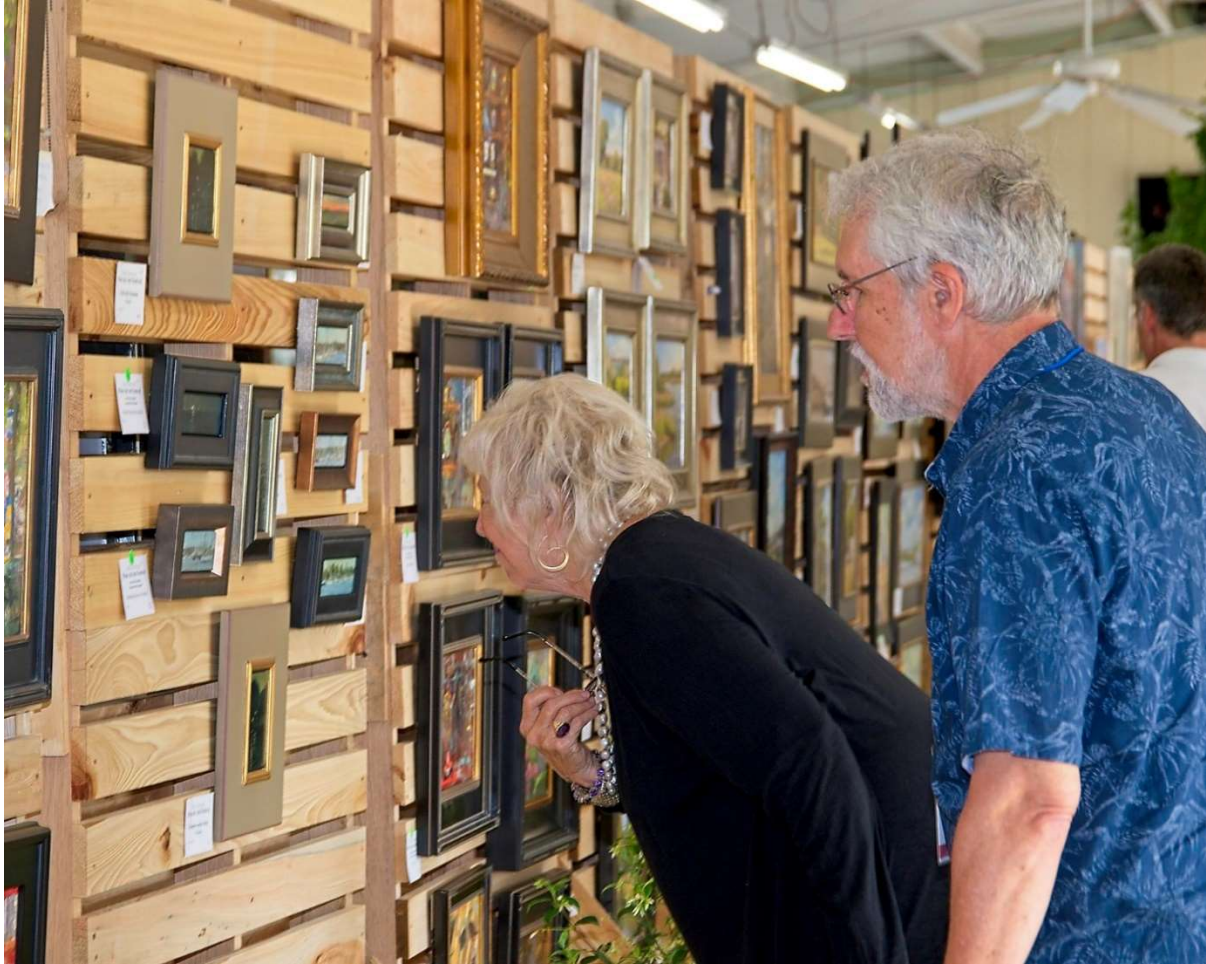
Exhibition and Sales for wet canvases – NC Plein Air Art Festival in New Bern

Festival headquarters, including demonstrations, daily gallery talks, adult and youth workshops, art displays, and sales, will be based in historic New Bern's Farmers Market, less than two blocks from Tryon Palace. In addition, pop-up exhibits, and art sales will happen in Beaufort and Oriental, with location details, dates, and times on the NC Plein Air website. All activities are free except the workshops, and a modest fee for artists to enter the Quick Paint competition (no charge for spectators).