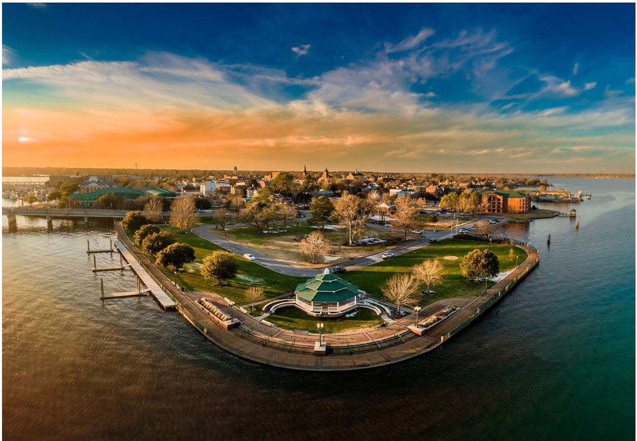
New Bern, North Carolina, on the banks of the Trent and Neuse Rivers