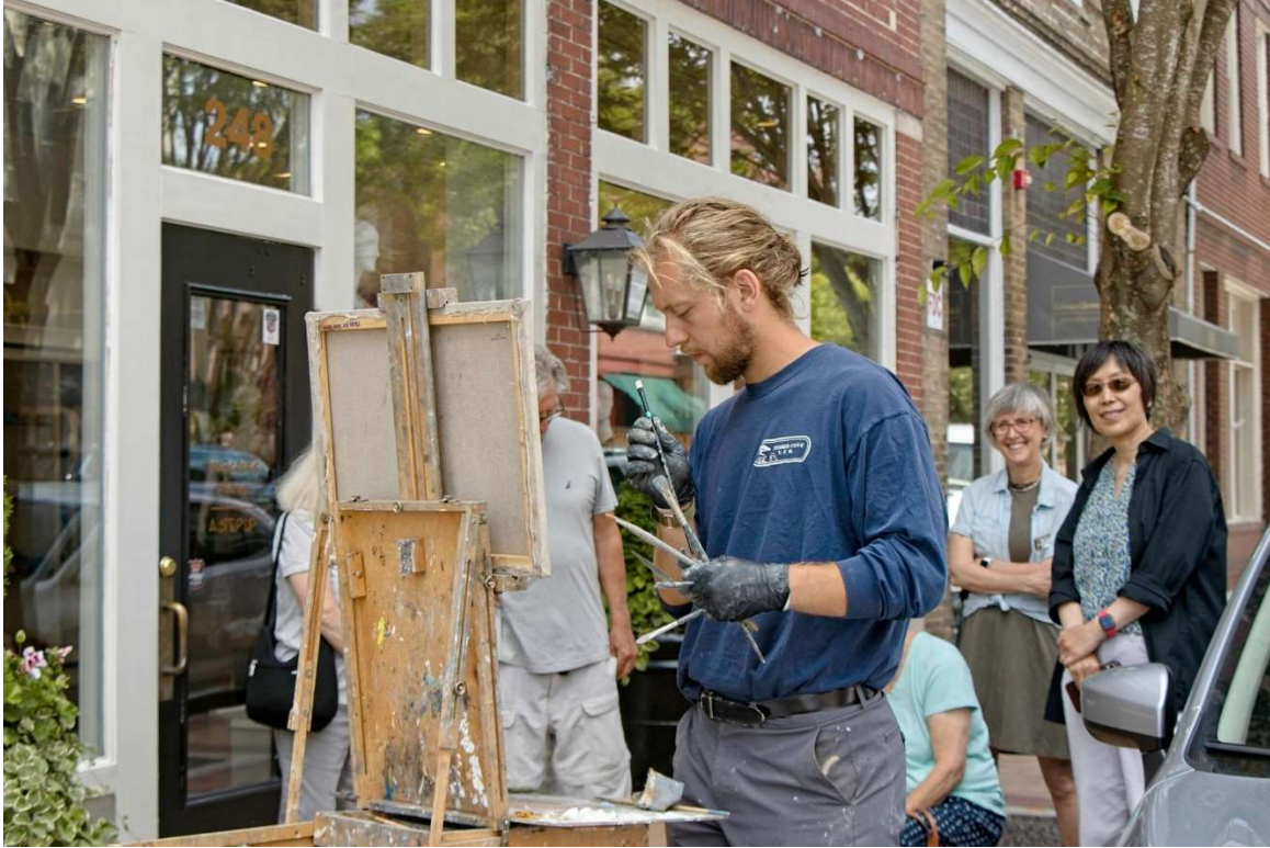
Daily scheduled demonstration to interact with artists. – NC Plein Air Art Festival in New Bern