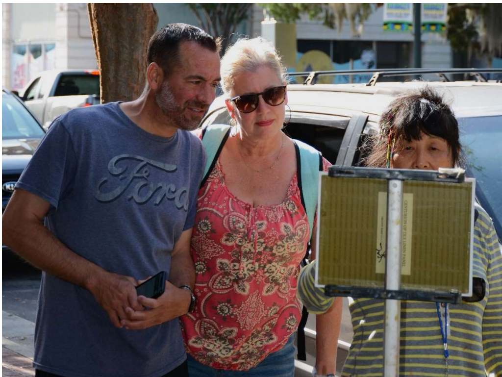
Watch artists create paintings from start to finish - NC Plein Air Art Festival

Painting venues include historic New Bern, the first state capital and second-oldest European-American town in North Carolina; Beaufort, the home of the North Carolina Maritime Museum; and Oriental, the sailing capital of North Carolina. In addition, artists will choose more sites and landscapes in Craven, Carteret, and Pamlico Counties.